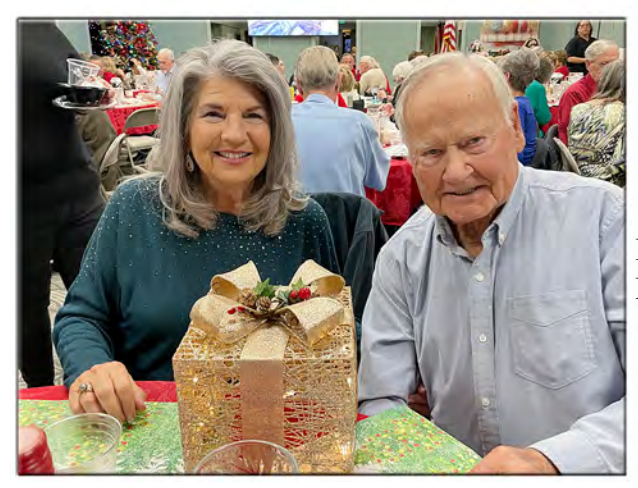
Centerpiece prize winners